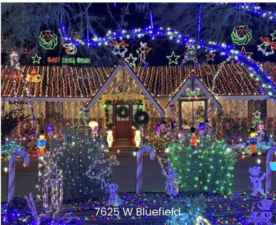
7625 W Bluefield